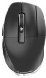
CadMouse Pro Wireless