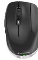
CadMouse Compact Wireless