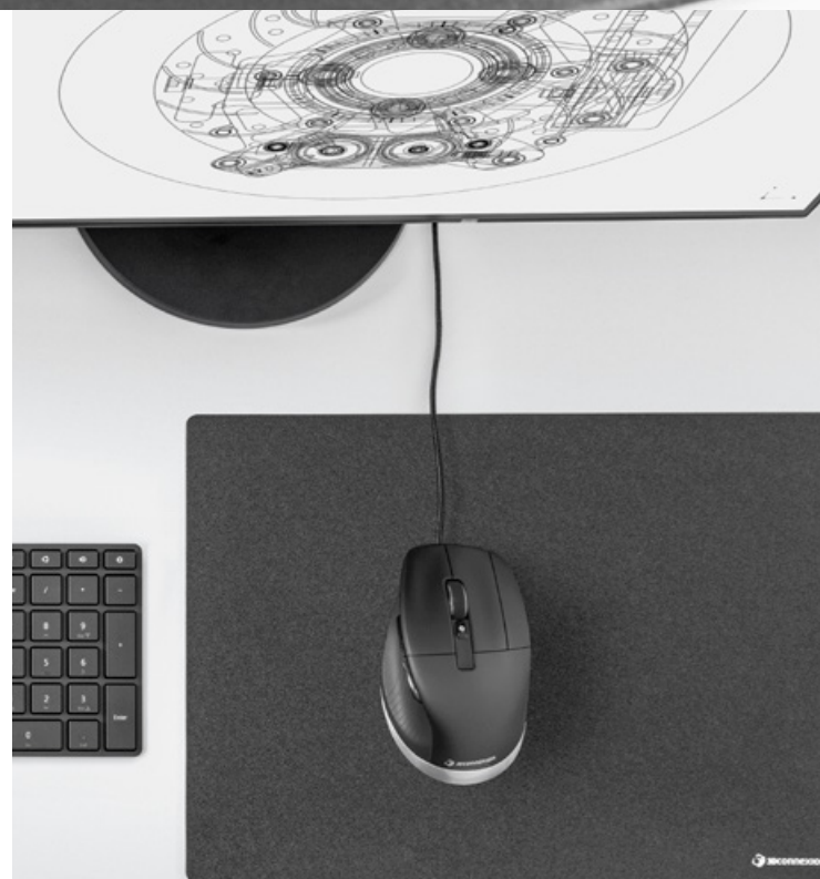
CadMouse Pro, CadMouse Pad

See website or contact us for details of supported applications.