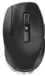
CadMouse Pro Wireless Left