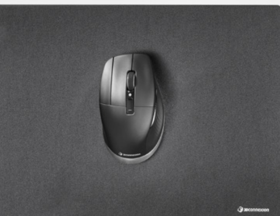
CadMouse Pro Wireless Left, CadMouse Pad

Left-side solution also available: CadMouse Pro Wireless Left