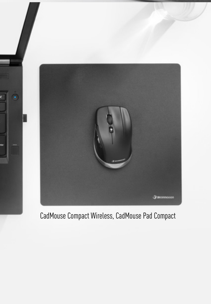
CadMouse Compact Wireless, CadMouse Pad Compact

Dedicated Middle Mouse Button – the days of clicking the mouse wheel are over thanks to the CadMouse's intelligent ergonomic design.