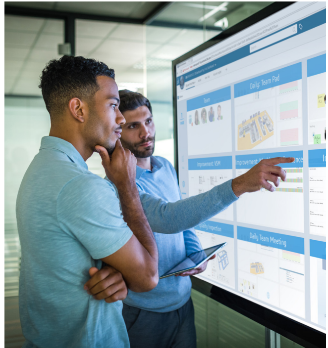
Enact Lean practices on the shop floor

DELMIA® 3DLean is a modern, customizable, and interactive solution that gives managers the ability to capture, monitor, and track operational meetings on the shop floor. It enables manufacturers to make Lean practices an integral part of shop floor operations by providing critical coordination and communication capabilities.